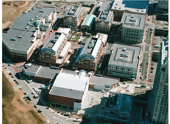
Atlanta's Atlantic Station is a successful example of infill development. Residents of Atlantic Station drive less than half as much as residents in other parts of the Atlanta Metropolitan Area.