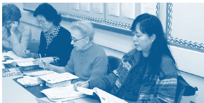
Students in an English class offered through the Adult Learning Centers at the Queens Borough Public Library.

The Austin Public Library has New Immigrants Centers that provide information, study and audiovisual materials, computer access, and software designed for independent, self-paced learning by immigrants. The library’s Committee on Adult Literacy and Immigrant Issues serves as the coordinating body for the Centers, with the branch library managers, reference staff, and other interested staff members participating.