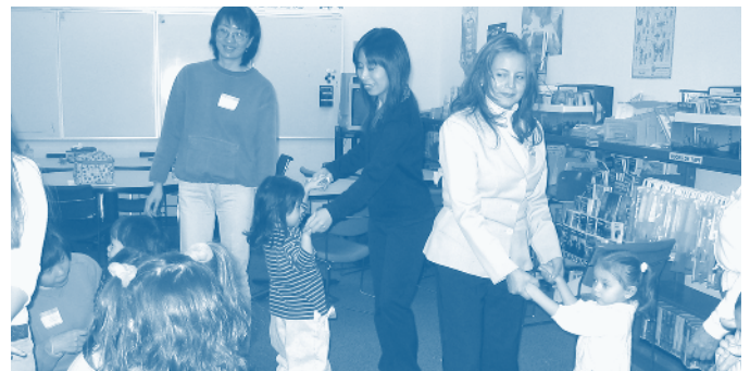
Participants in the Family Literacy class at the Queens Borough Public Library where parents and children learn English and other coping skills together.

Family and intergenerational programs enable libraries to attract patrons of all ages. Participants noted that they try to attract immigrant families by offering various types of afterschool and evening programs. Other libraries work with local schools to design programs to meet specific needs, such as a workshop on English grammar for students or a library tour for parents.