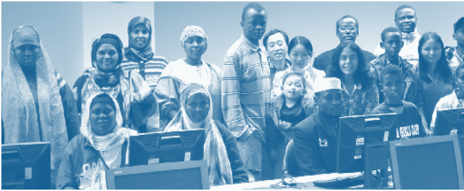
Students at The American Place, a free library service for immigrants and refugees at the Hartford Public Library.

A first step toward building partnerships is involving the local immigrant community in the life of the library. Libraries should solicit their advice on programs and services and invite immigrants and representatives from community organizations and local agencies to serve on advisory councils or working groups.