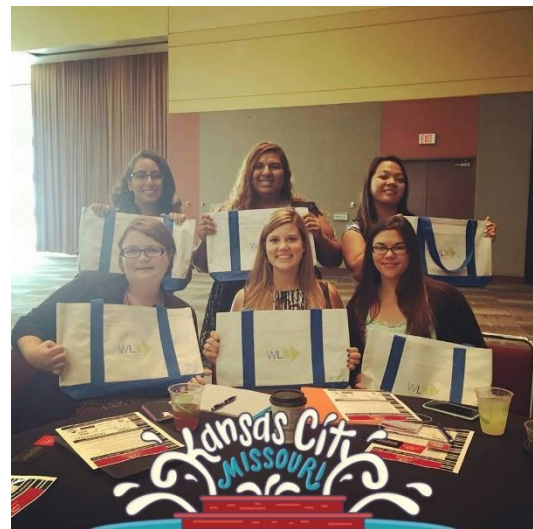
NIU MPA students who participated in the women's workshop at 2016 ICMA Conference in Kansas City, MO.

Over 30 NIU MPA students attended the 2016 ICMA Conference in Kansas City, MO. The 2016 ICMA Conference was a highlight for recent graduates and continuing students.