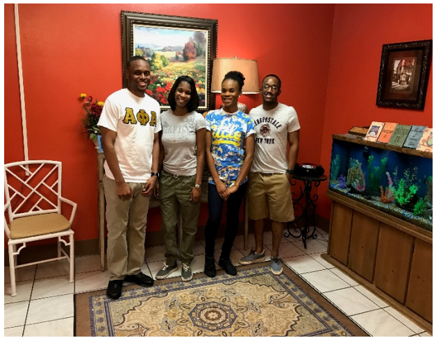
Volunteer at Cedar Crest Rehabilitation Center