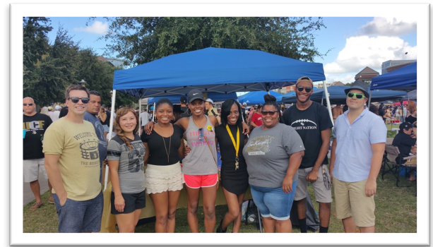
ICMA UCF Student Chapter Tailgate