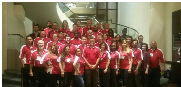
NIU MPA students and staff who attended the 2016 ICMA Conference in Kansas City, MO (NIU MPA t-shirts were provided to students and staff that were at the conference).

In addition, numerous chapter members attended the following events with many students receiving scholarships to attend: