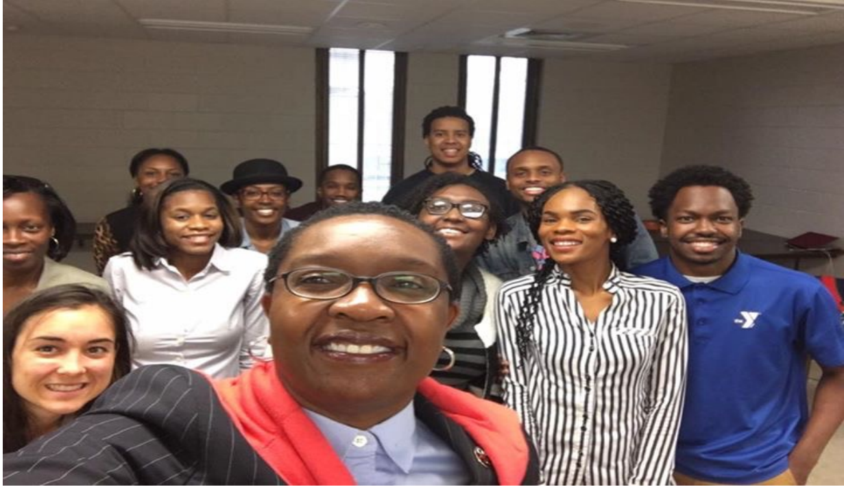
AUM ICMA Chapter pose for Selfie with Speaker