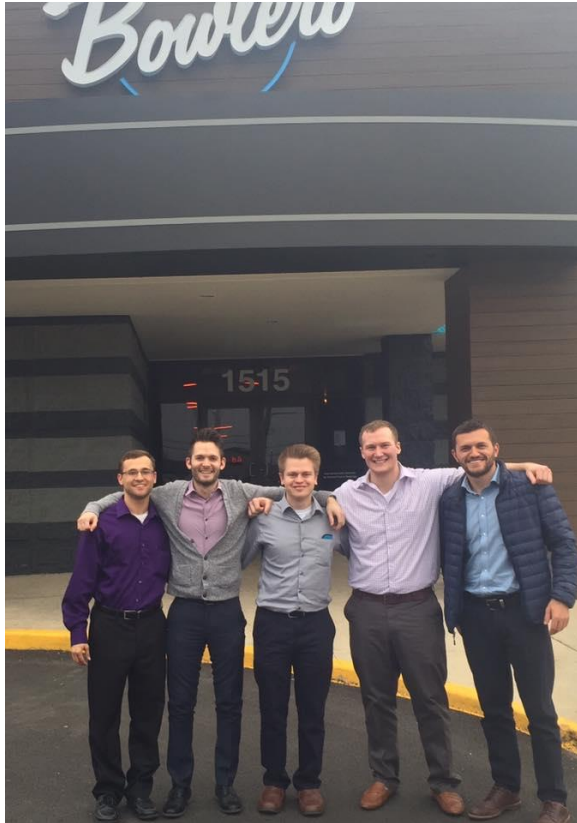
NIU MPA students at a bowling alley.

NIU ICMA Student Chapter is proud of bringing students together by hosting a few social events throughout the academic year. Social events included a few dinners in different municipalities and a bowling alley event.