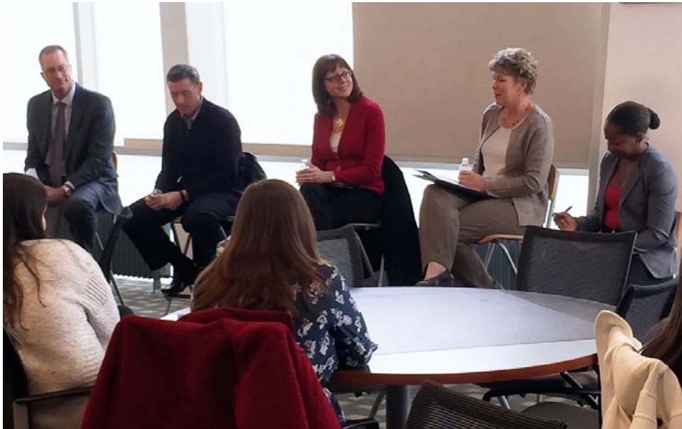
Panelists at the Fall 2016 Local government Manager Panel