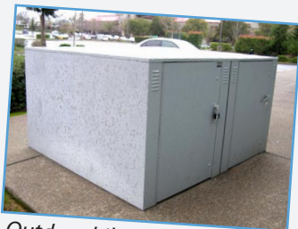
Outdoor bike lockers.