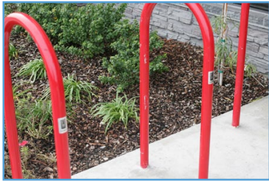
Recommended bike rack, insufficient clearance from landscaping.