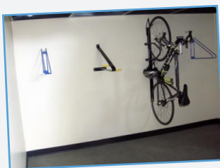
A bike room at the Roseville Civic Center.