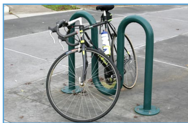
Acceptable bike racks.

Recommended racks support the bike with at least two points of contact; minimize the potential for damage by not binding the wheel; and allow the user to lock the frame and at least one wheel. These racks are suggestions - there may be others that work well.