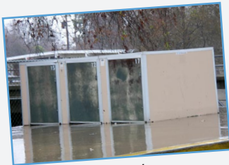
Outdoor bike lockers.