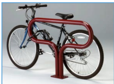
Recommended bike racks.

Bike racks should be placed in close proximity to the bicyclists destination (i.e. the front door of a business) in a highly visible location (visible from windows) that is illuminated. Bike racks should be installed with minimum clearances from walls, landscaping and driveways per manufacturer's specifications.