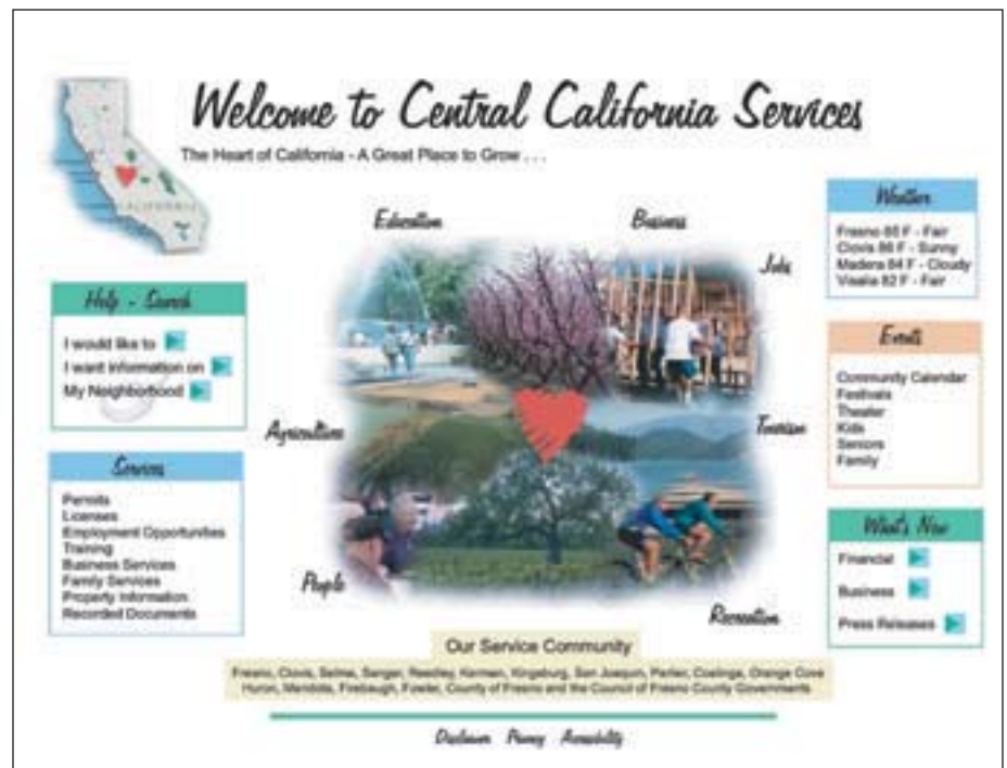
The common portal through which users can access regional services.

A Regional e-Government Task Force was created to accomplish this initiative. The task force has adopted the following vision to evaluate all phases of our development: acquisition, implementation, maintenance and operation of the multi-agency Internet based e-government systems. Our vision statement is: "To ensure customer satisfaction with Central Cali-