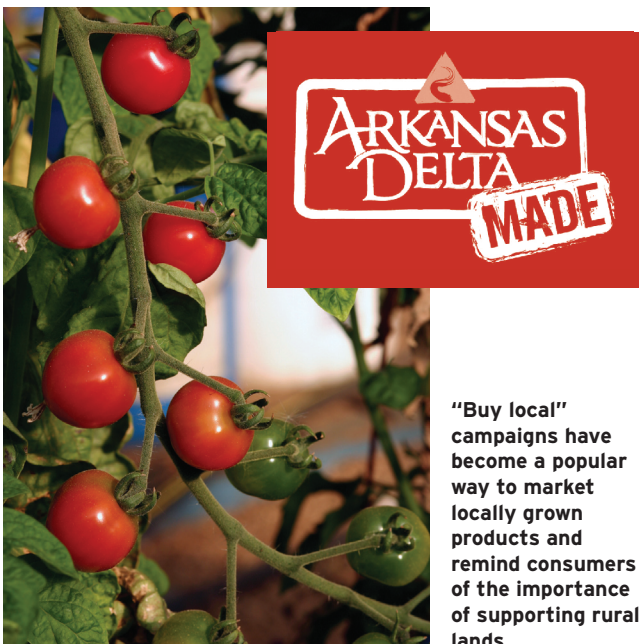
"Buy local" campaigns have become a popular way to market locally grown products and remind consumers of the importance of supporting rural lands.

Priority funding areas (PFAs) identify geographic areas that qualify for financial or other assistance, such as infrastructure or accelerated project approval. Typically designated at the state level and supported by local decisions, PFAs create incentives for development to take place in particular areas, including those where infrastructure exists already, while removing incentives for growth pressure in undeveloped areas. Connecticut identifies PFAs as regional centers, growth and redevelopment areas, and distressed municipalities. The state specifically requires that state agencies "cooperate with municipalities to ensure that programs and activities in rural areas sustain village character." 27