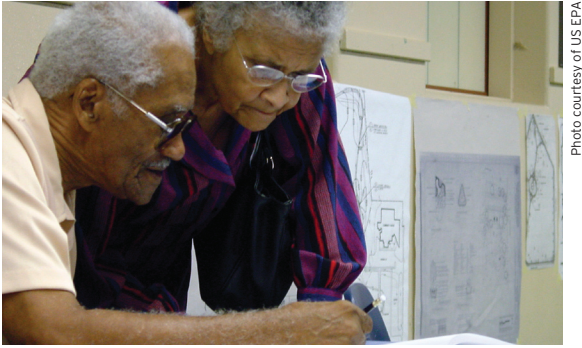
Residents can help determine priorities for preservation and new growth.

assist in stormwater management and reduce the heat island effect; using the public right-of-way for multiple purposes, such as trails that can permit both stormwater management and recreation; and strategic plantings to allow biofiltration to treat runoff and improve water quality. A more specific example might be a tree canopy that absorbs excess runoff, lowers roadway temperatures, and improves air quality. This kind of amenity not only reduces infrastructure demand but also can improve a community's appearance and help it support active transportation, including walking and bicycling.