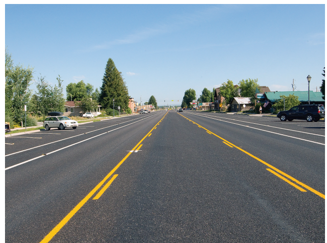
Streetscape improvements can help draw people to a community’s downtown area. In Idaho, Victor’s Main Street, shown here before and after improvements, was renovated with assistance from the EPA’s Smart Growth Implementation Assistance program. The improvements have helped lower traffic speeds and provided enough parking to serve local businesses.