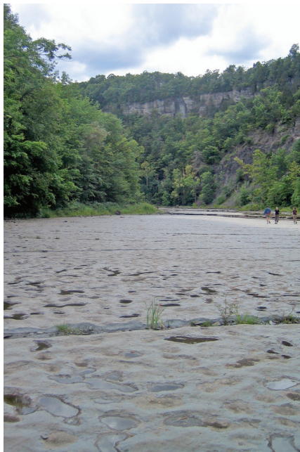
Parks and natural resources areas can be significant community assets. Taughannock Falls State Park in Tompkins County, New York, shown here, provides residents with a scenic place to swim and hike and draws tourists to the area.