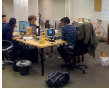
TechArb in Ann Arbor