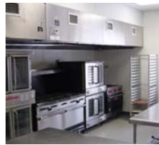
The Starting Block in Hart