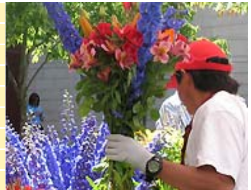
City Hall Farmers Market, Seattle, WA