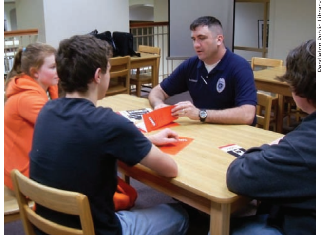
Pendleton's Wired for Safety Project helped police officers engage teenagers in discussions about public safety at the library.

Buena Vista, Virginia also had a vision of using the library for economic development. In this case, the goal was to improve the relatively low wage structure in this economically challenged area by training unemployed and underemployed residents to staff call centers. Information literacy—introducing the use of technology to those who had not yet ventured into the world of computers for any purpose, let alone as a means to a better career—was a key component of the Buena Vista project.