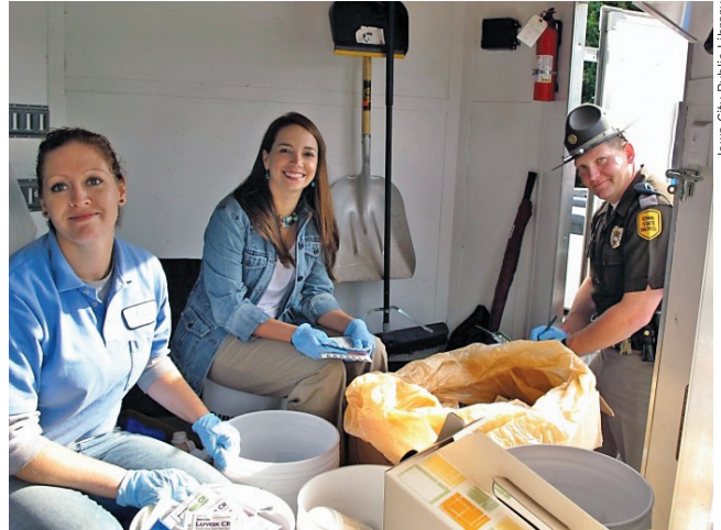
Iowa City Public Library staff members and community partners conduct their first of two expired pharmaceutical collection events. This very successful event netted over 135 pounds of expired or unused pharmaceuticals.

including the library director, police chief, city attorney and facilities manager. As a result he states that he has developed a new relationship with the library director, a better understanding about the library, and a greater appreciation for the multiple talents of the members of his team.