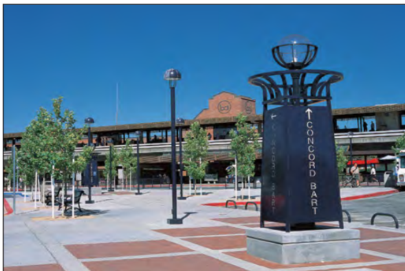
Downtown BART Station Plaza