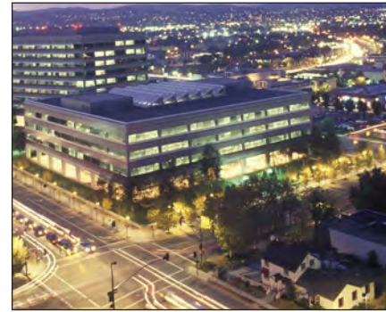
Bank of America Tech Center