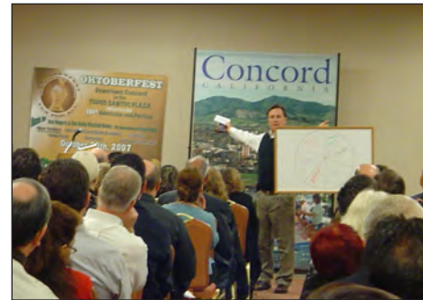
Concord Small Business Seminar

A. Goodwill Visits. The City’s Economic Development Program will continue to conduct goodwill visits to major employers and sales tax generators to build strong, long-term relationships, improve communication between the City and the business community, demonstrate Concord’s concern for its existing major businesses, and to encourage these businesses to remain and expand in Concord.