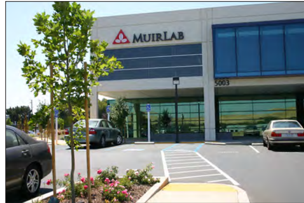
John Muir Health Core Lab

These emerging industries may have special needs with respect to infrastructure, workforce development, Zoning and General Plan issues, and business services. The City will incorporate the needs of these key industries as it works to continuously improve its delivery of efficient, effective business services, and as it continues to update the Zoning Code (scheduled for completion in 2010) and other City policies.