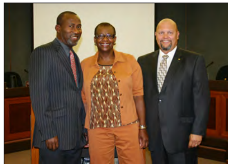
Business Recognition Award Recipients with the Chamber of Commerce