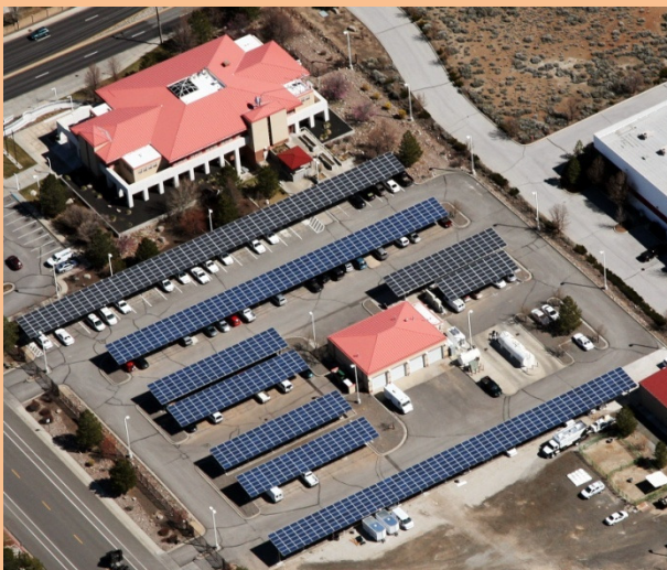
Aerial view of Sparks Police Department Photovoltaic Project