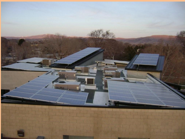
Roof view of Larry D. Johnson Community Center Photovoltaic Project

Future sustainability projects for Sparks could include wind energy