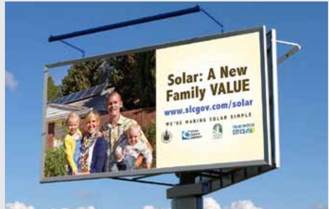
Billboard from the Solar Salt Lake Partnership's solar campaign.