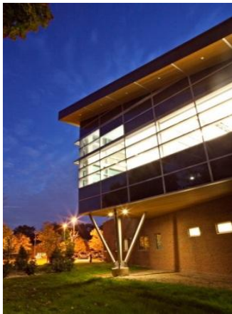
Newly renovated City Hall in Farmington Hills, Michigan

The City of Farmington Hills, Michigan, a metro Detroit suburb with a population of 79,740, has