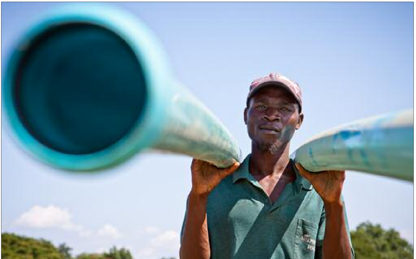
Installing micro-jet irrigation in Zimbabwe.

In budget requests and CDCS submissions, Missions proposing food security and global health programs should consider, as relevant and appropriate, how water interventions help support their program objectives. Missions proposing WASH programs should consider linkages between WASH programs, and food security and global health efforts.