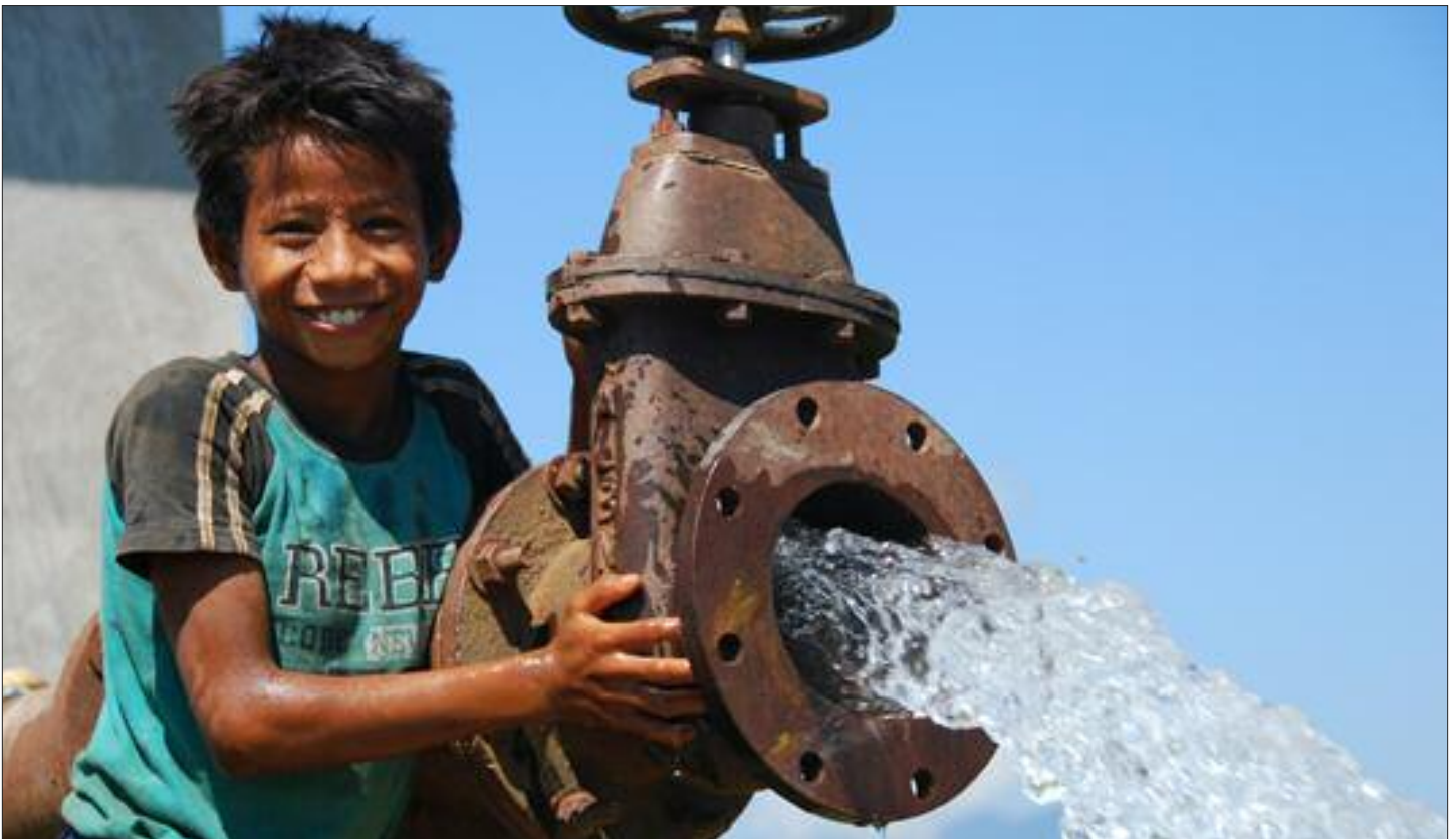
USAID-built electric tube well used for irrigation in the Terai region of Nepal.

SO1) Improve health outcomes through the provision of sustainable WASH. This will be achieved through a continued focus on providing safe water, an increased emphasis on sanitation, and support for programs that can be brought to scale and be sus-