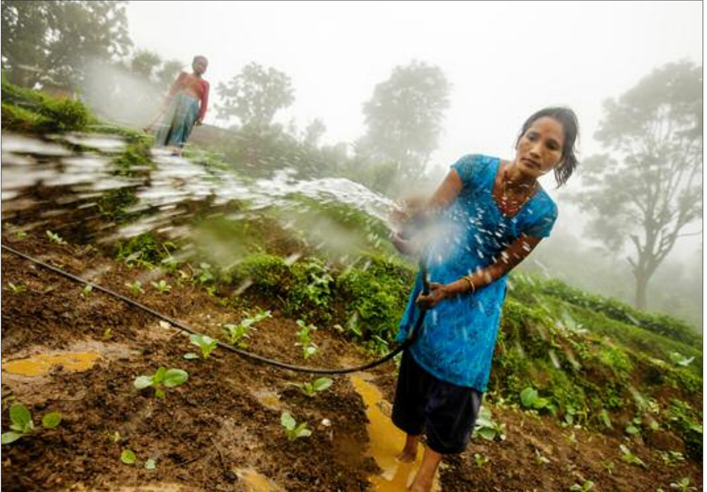
Improving productivity with environmentally-friendly irrigation in Nepal.

The following governance and management approaches can increase the efficiency of an irrigation system: