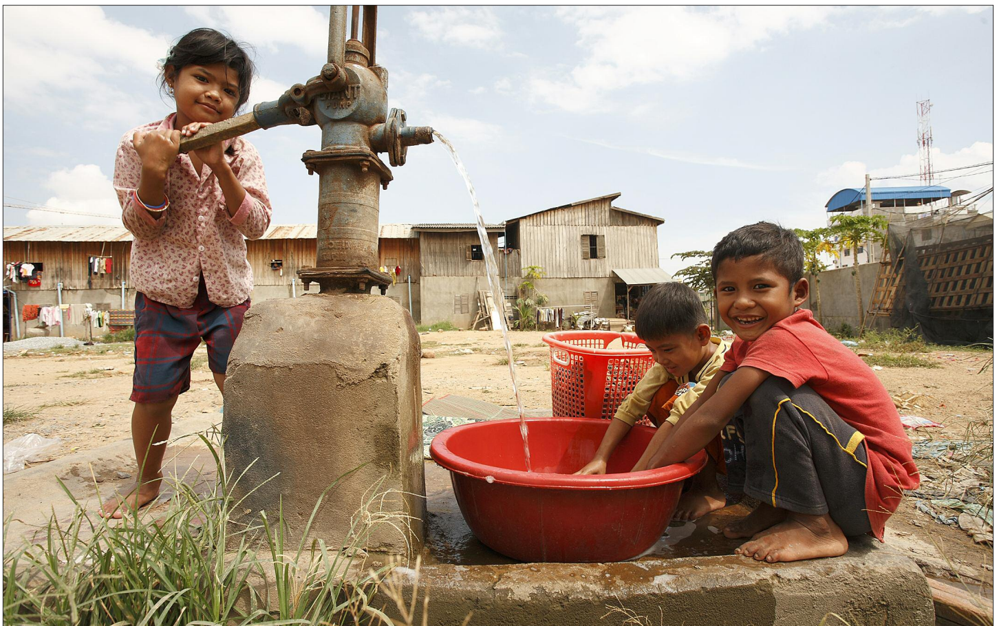
Making water accessible for everyone.

The Strategy raises the importance and visibility of water as a development priority, and highlights its importance to meeting the development imperatives of improved health and increased food security. Improving human health and welfare, and maintaining the sustainability of natural systems, requires a coordinated global response to the challenges of water access for present and future generations. This Strategy reflects the commitment of the U.S. Government to work in partnership with the global community to meet these challenges.