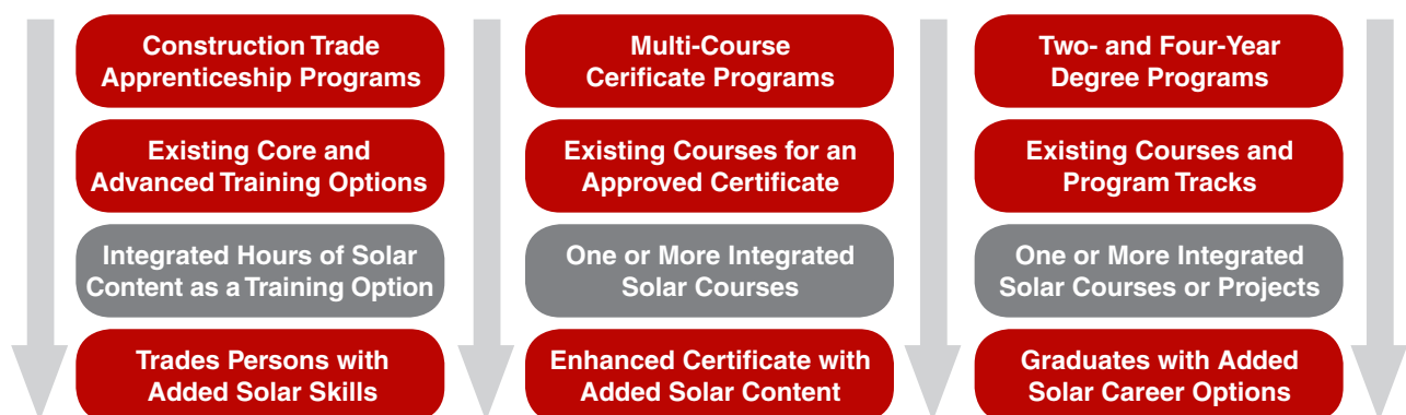
FIGURE 2: Opportunities for Integrating Solar Content

The middle column in Figure 2 shows opportunities for integrating solar courses into existing multi-course certificate programs. For example, the National Science Foundation (NSF) continues to sponsor numerous Centers of Excellence through its Advanced Technological Education (ATE) program. Educational institutions, primarily community colleges and their industrial partners that are part of these centers, focus on relevant topics such as advanced manufacturing technology, energy and environmental technologies, electronics, micro- and nanotechnologies, engineering technology, construction technology, and industrial technology. As a result, there are many multi-course certificate programs that develop knowledge and skills that are closely related to the needs of the solar industry. Appropriately integrating one or more solar courses into existing certificate programs both enhances them and makes students more marketable in pursuing job opportunities.