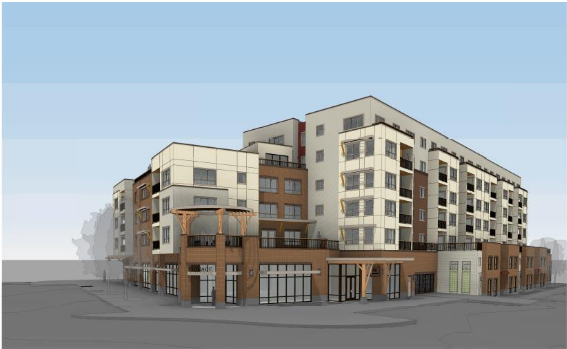
Phase 1 Residential Building