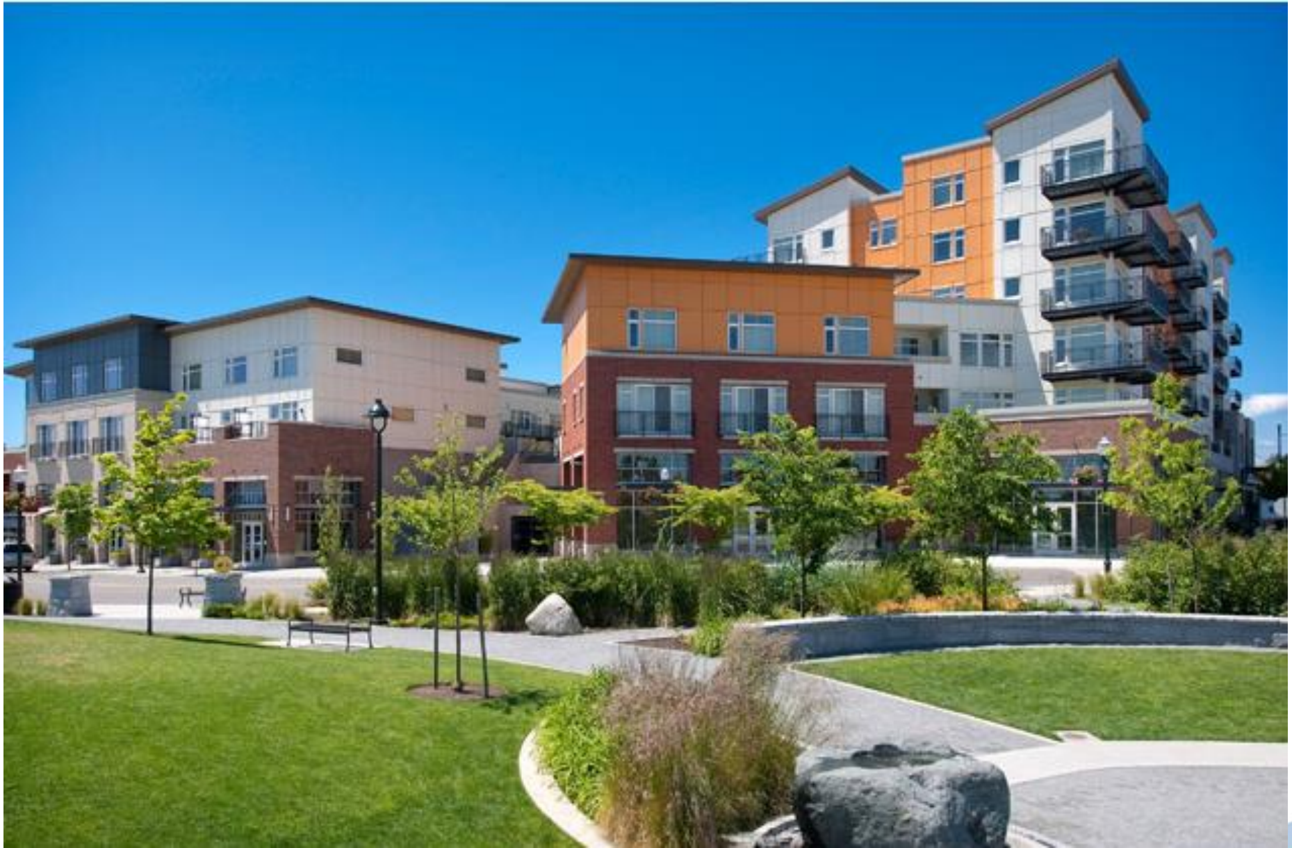
Burien Town Square