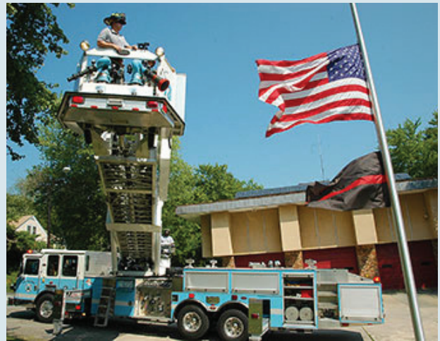
Town of Chapel Hill Fire Station #1 solar PV panels and biodiesel fire truck.

Solar Bus Stop. Thanks to a 2007 donation by what was then called the Million Solar Roofs Committee, a bus stop on Franklin Street was outfitted with a 165-watt solar