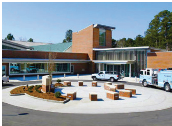
Chapel Hill's public library.