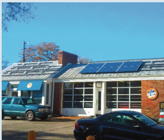
Chapel Hill Tire Care Company’s rooftop solar PV system.

As part of its Green Plus Certification, Chapel Hill Tire Care Company installed a 4.8 kilowatt solar photovoltaic (PV) system on one of its facilities. The system uses twenty Enphase microinverters and twenty 240-watt renewable energy-credit solar modules, which are expected to generate over 6,700 kilowatt-hours every year—the equivalent of offsetting 9,000 miles driven per year. Chapel Hill Tire Care Company specifically chose a solar PV as a way to improve its environmental performance because of the partner discount pioneered by Yes! Solar Solutions. Originally the discount was created to reduce the cost of a home solar PV installation, which had increased significantly because of the high cost of solar PV panels, inverters, and other equipment. The cost of such equipment has since seen substantial reductions, and as of the date of this case study the discount is available on a limited basis.