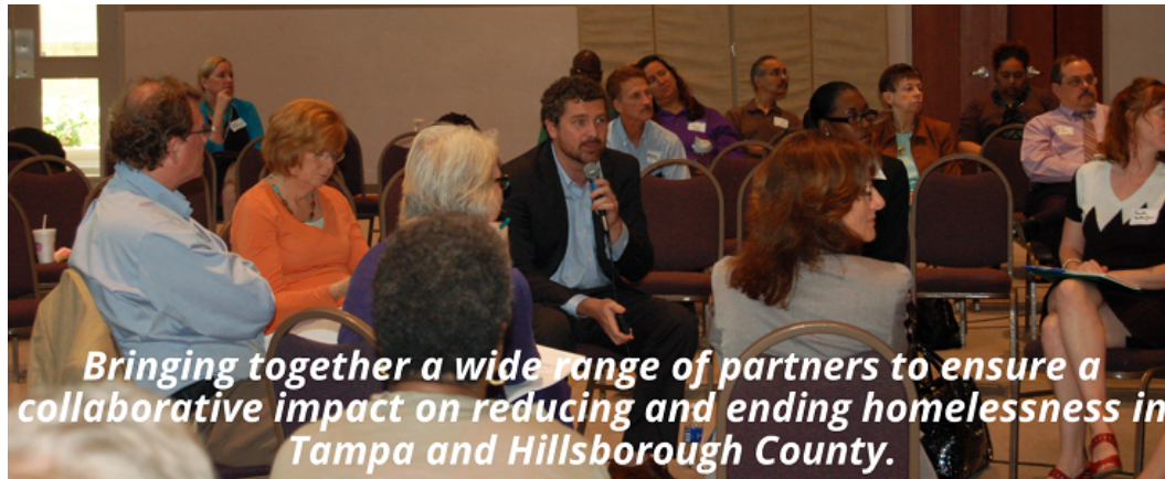
Bringing together a wide range of partners to ensure a collaborative impact on reducing and ending homelessness in Tampa and Hillsborough County.