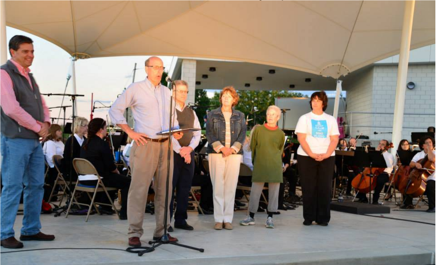
Photo: The City of Hamilton Mayor Pat Moeller speaking during the Installation of tensile structure (canopy) and dedication ceremony at the RiversEdge in 2013. From Left: Architect Mike Dingledein, Mayor Moeller, Councilman Wile, Councilmember Fiehrer, Councilmember Klink and City's Volunteer Coordinator Wittmer.