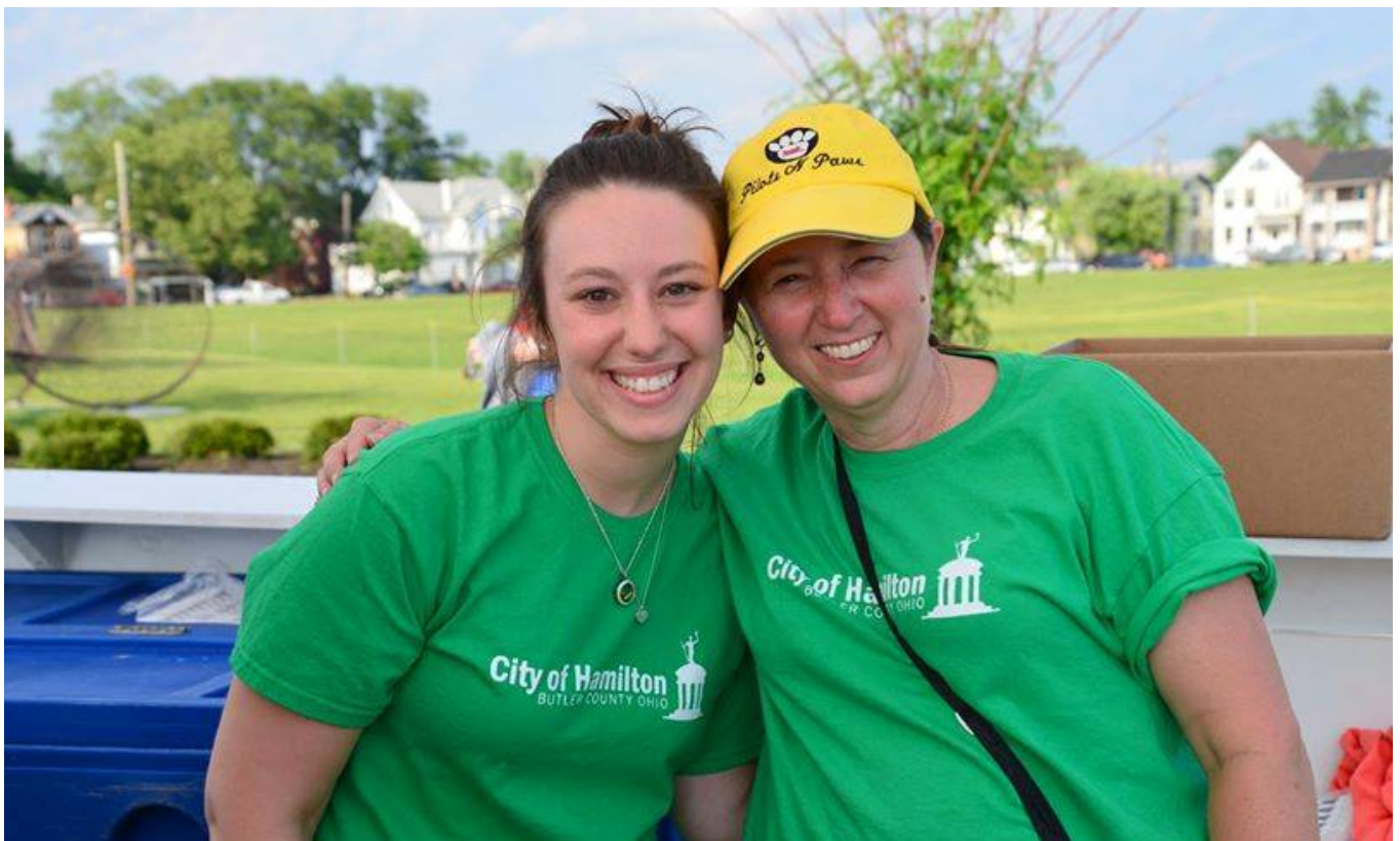
Photo: City employees volunteering at the concert series at the RiversEdge during Summer Concert Series in 2013