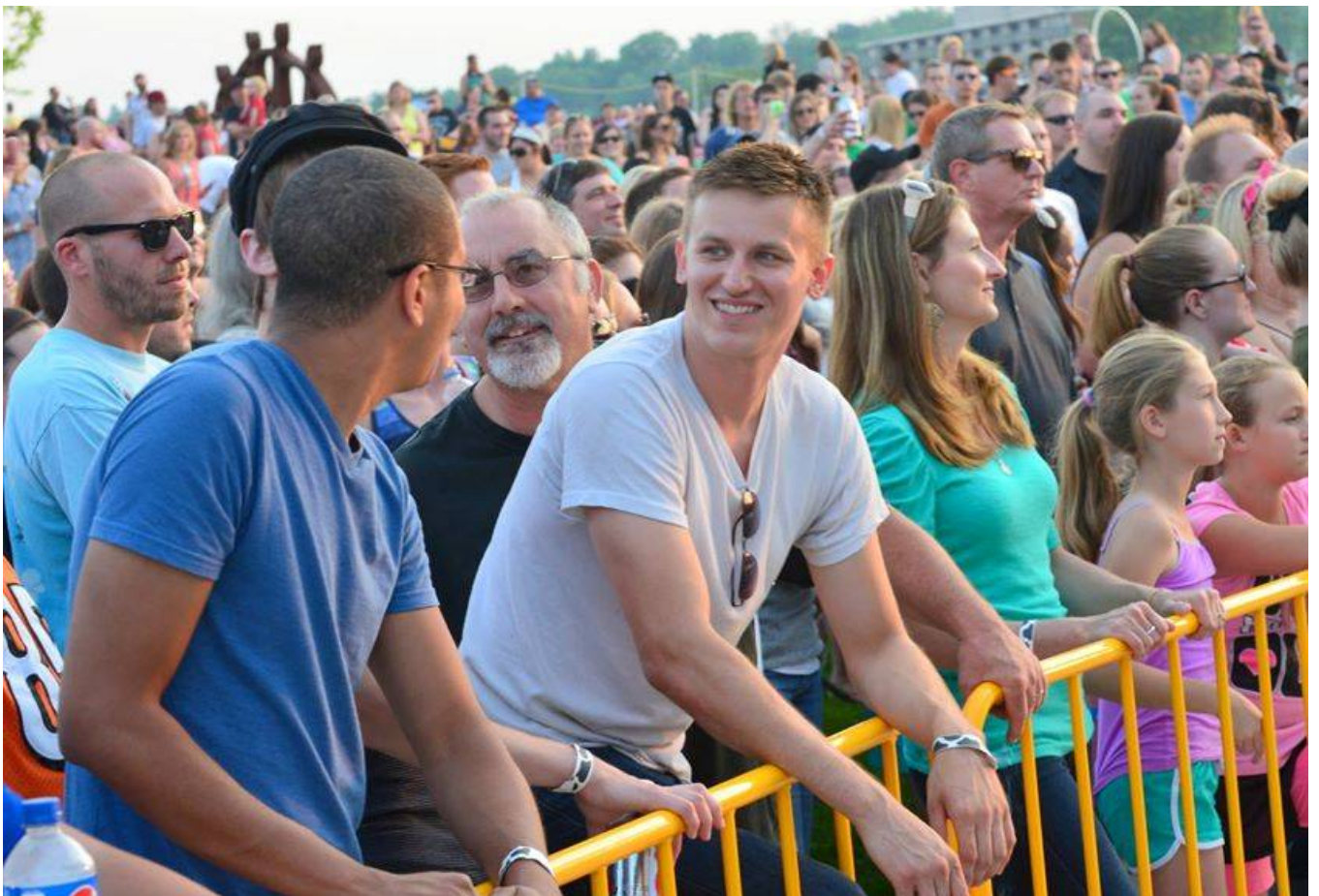
Photo: at the concerts people sometimes meet their neighbors whom they did not know about