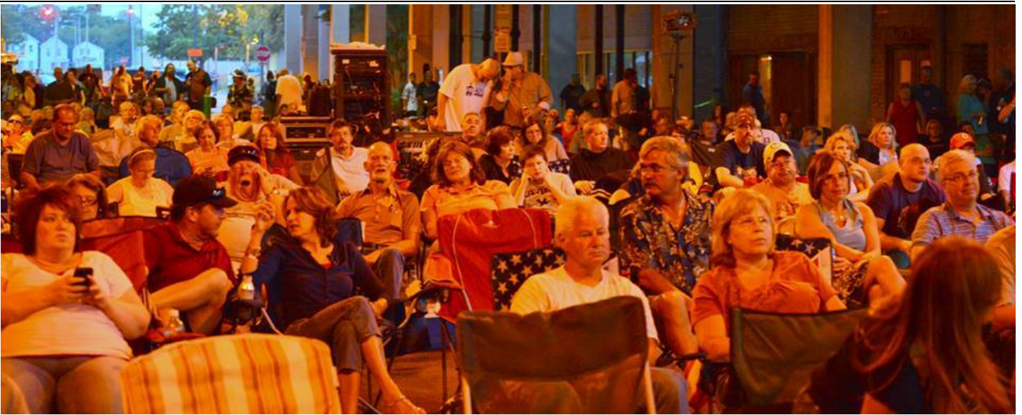
Photos: 2012 Summer Concert Series under the City Garage on Market Street portion between North 2 nd and North 3 rd Street.