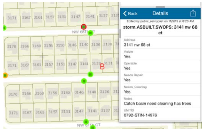
Fort Lauderdale's SWOPS application, which is used to carry out the NPDES stormwater activity mandated by the State Department of Environmental Protection, saves numerous labor hours.

The city of Fort Lauderdale hosts an annual event called Neighbor Support Night. This event allows city departments and officials to strengthen ties with their constituents and build public awareness of relevant issues. This