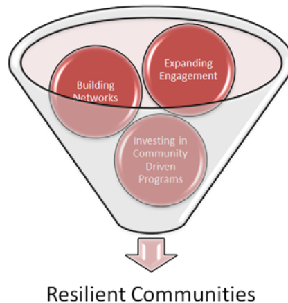
Figure 2: Prevention Components

Prevention, as intended for this Framework, is defined as collective efforts aimed at closing a range of gaps and social openings by which violent extremist ideologies can find legitimacy. Prevention strategies aim to build healthy, resilient communities where it is more difficult for violent ideologies to take root. Prevention efforts are driven by local communities and supported by government partnerships.