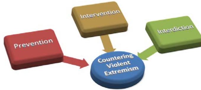
Figure 1: Los Angeles CVE Framework Overview