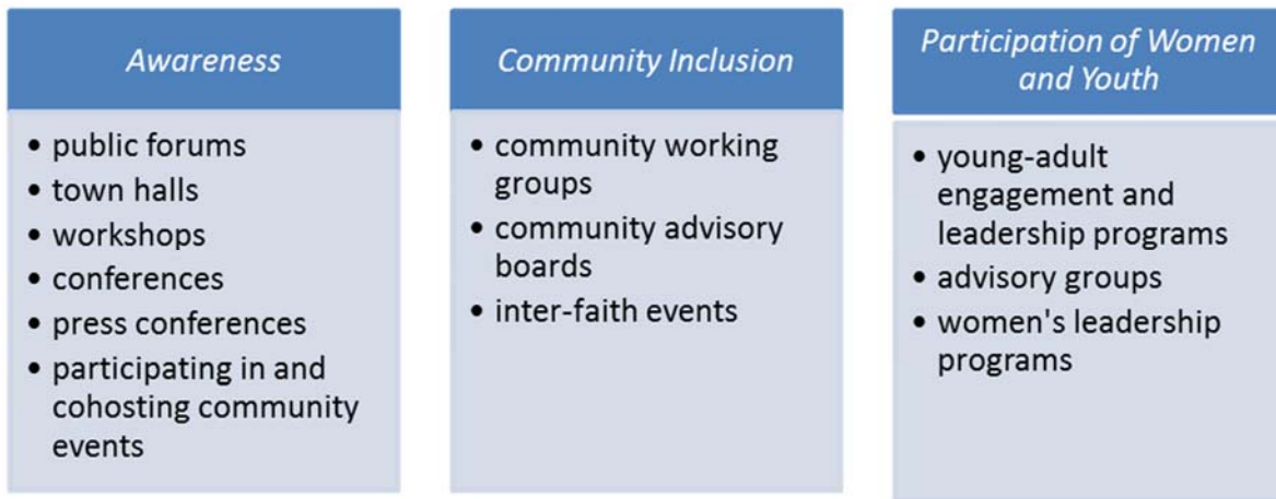
Figure 3: Established Formats for Engagement

Currently identified formats for government-driven engagement include: