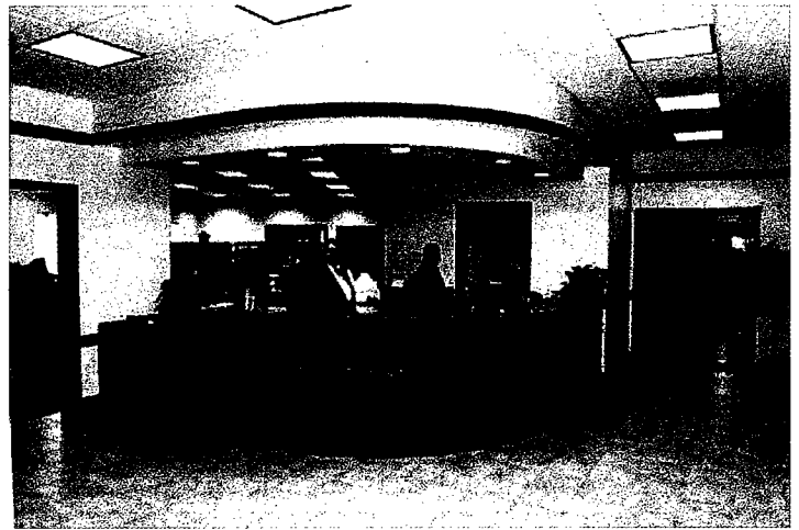
The recently completed new municipal center exemplifies the success of the City. In March 2003, the City moved from an aging facility to a new City Hall with over 30,000-square-feet of office space.

Security in the building is maintained by a closed circuit TV system, which can monitor 13 separate TV monitors in and around the building. The police dispatchers who monitor the security system 24 hours a day are also