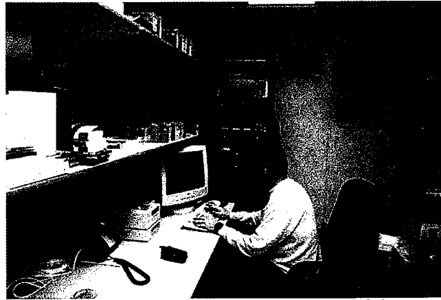
The City's IT Department, that oversees a system of six servers and more than 70 computers, enjoys its new space in the new municipal center.

The new City municipal center has "state-of-the-art" computer technology support, with an internal network (LAN) and an extended network via fiber optic cable to include four different off-site locations within the City such as the City transfer station, fire stations and public works departments. The growth of the City IT Department, mirrors the growth of the City, in the past five years, they have gone from a system with one server and 12 computers to a system of six servers and over 70 computers. The IT Department uses tape backup systems for data recovery and also has recently upgraded the City Web site at www.saintrobert.com .