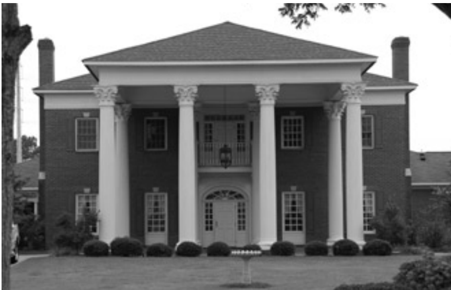
The Springfield Place Retirement Community also won recognition for Newberry, South Carolina, by The Bond Buyer .