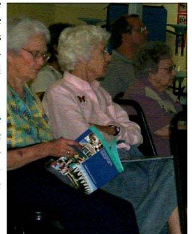
Above: Age is a significant dimension of our diversity.

Vision: "Hampton will thrive as a diverse community which celebrates, supports, and encourages positive people-to-people relations as a foundation for community success."