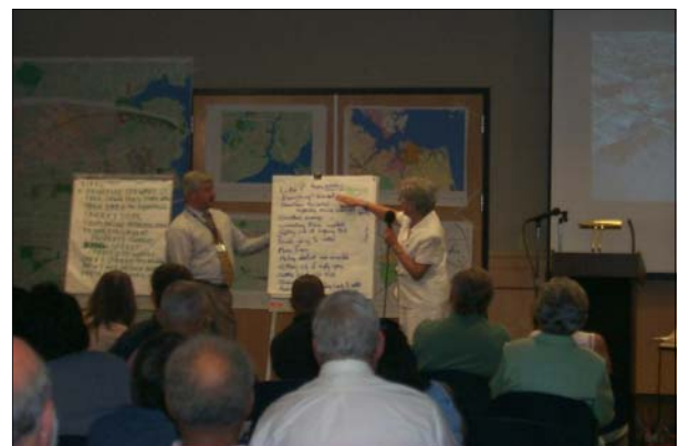
Above: Residents of Pasture Point Neighborhood provided feedback on possible ways to preserve and enhance their neighborhood.