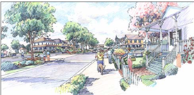
Above: Rendering of Penbroke Avenue beachfront housing included in Buckroe Master Plan.

Vision: "Hampton neighborhoods: the best places to be."