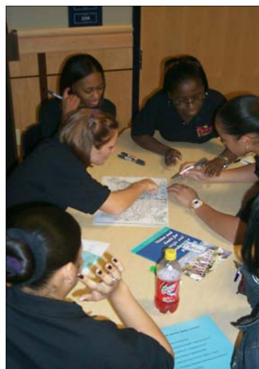
Left: Hampton Youth Commissioners participating in a workshop to discuss the vision and goals for the youth.

In order for Hampton to become the kind of city we all want it to be, we must make sure that every young person has the opportunity to grow up in a caring community in which young people are viewed as partners and valuable community resources. Providing this kind of community environment allows our youth to feel empowered so they become integral contributors within a diverse community. As a result, the youth of Hampton will become well rounded, capable, caring, and productive citizens who will choose to invest their present and future into this community.