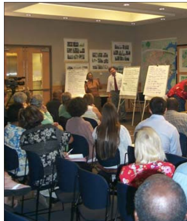
Right: Residents of Olde Hampton neighborhood provided comments to consultants and City staff on the main recommendations to be included in the Downtown Hampton Master Plan.