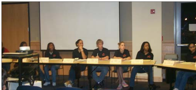
Above: Public meeting in which the Community Plan Vision and Goals was officially endorsed by Hampton's Youth Commission.