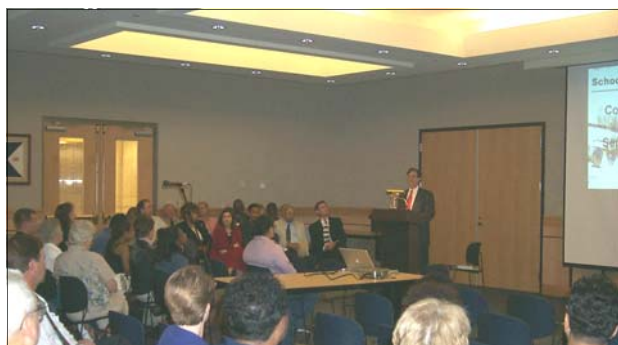
Above: In June of 2005, the school facilities panel presented their final recommendations for upgrades and new school construction.

The families who make Hampton their home depend upon a strong school system to provide exceptional learning experiences within quality school facilities. As a community, Hampton depends upon a strong school system to serve as a catalyst for economic growth and vitality as well as a strong sense of community within its neighborhoods. It is the vision of the city and the school system to provide unparalleled education to the young people who are attending Hampton City Schools and that these young people will ultimately decide to make Hampton their home.