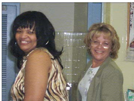
Right: 311 employees greet attendants during Community Plan meetings.

Vision: "Hampton will provide unparalleled public education, neighborhood, city, and community service that will exceed its customers' expectations."