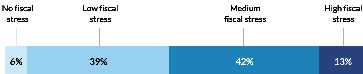
Figure 1: How would you rate the fiscal stress faced by your local government in calendar year 2021? (n=422)

Figure 2 summarizes respondents' expectations about their local governments' revenues over calendar year 2021. Slightly more than a quarter of the respondents reported that their revenues would decrease. More than 35 percent expected revenues to remain flat, while 22 percent were expecting them to be higher. The data do suggest a level of uncertainty as more than 15 percent suggested that it was too early to tell what the year ahead will look like for local revenues.