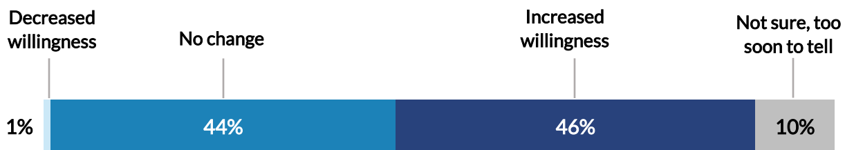
Figure 3: In your opinion, how have the challenges of the past year influenced your local government's willingness to consider alternative service delivery strategies in the next 3-5 years? (n=422)

Figure 4 provides additional detail about the types of ASD models that local governments already began to explore over the course of 2020. Two-thirds (66 percent) of all survey respondents had explored at least one type of ASD approach. The most common type explored was inter-governmental agreements, assessed by half of all survey respondents.