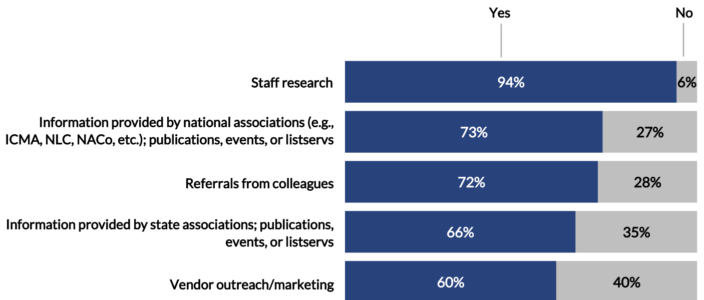
Figure 5: How does your community learn about innovations in alternative service delivery? (n=380)

Methods by which local governments explore and research ASD options vary. Most places use multiple methods to better understand options that are available and appropriate for their jurisdiction. Nearly all (94 percent) rely on staff research; vendor outreach, information shared by state and/or national associations, and referrals from colleagues each factor into decision-making for a majority of local governments.